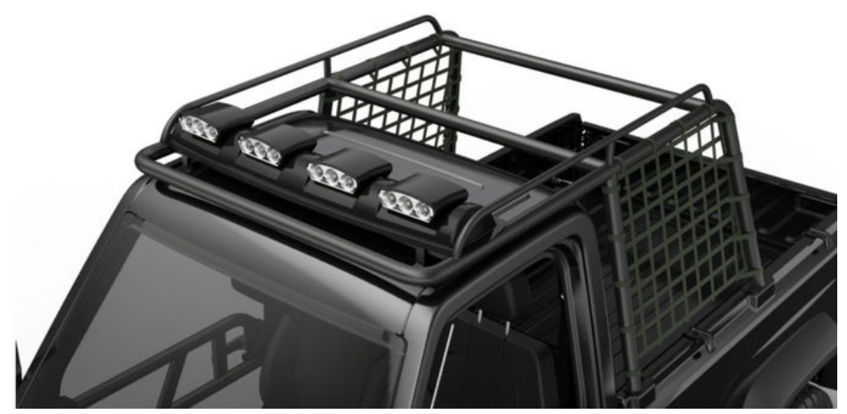
Details Pictures of Back Container: